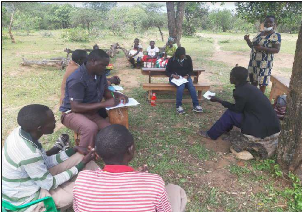
Figure 4-1: Data Collection (Questionnaire) – Villagers

FGD sessions were held with community members who are the direct beneficiaries of the proposed project. The FGD yielded qualitative information on the perception of key stakeholders' major social and environmental issues of concern. The information gathered, was cross-checked with the existing empirical data, to ascertain its validity and reliability. During these sessions participants discussed in detail issues that are pertinent to the assessment of the socio-economic feasibility of the proposed borehole project.