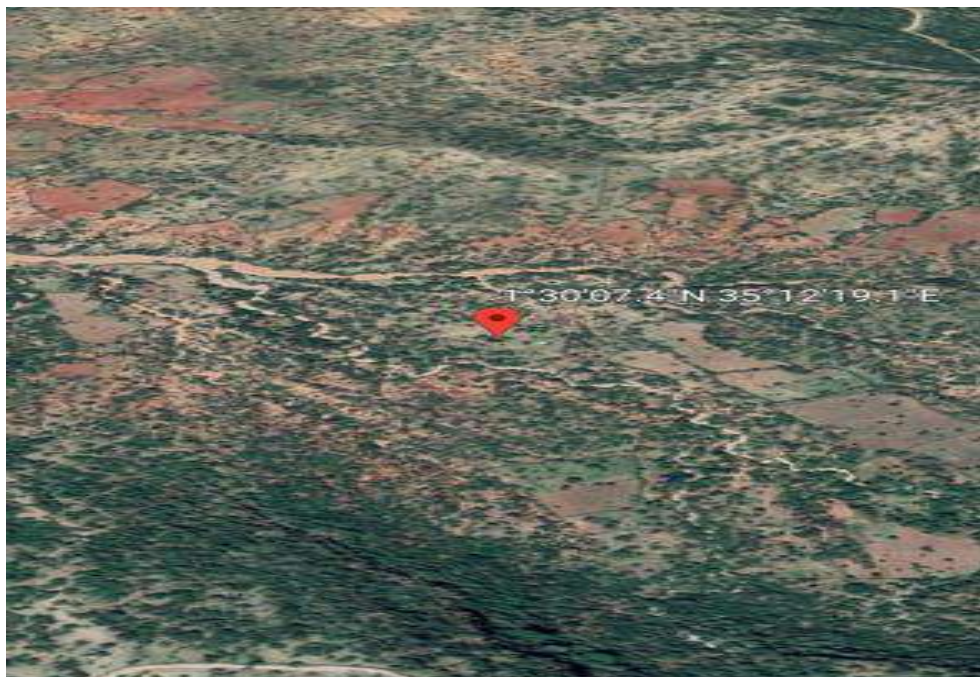
Figure 2.2 Google Earth image of the proposed site for the borehole

The proposed project will be located on land donated by the community of Sachir Village, Tirken Sub Location, Shalpogh Location purposely for water provision for domestic and livestock use for the community. The project site is on GPS coordinates 035.20529667 E and 01.50204167N with an altitude of 1634.9M.a.s.l